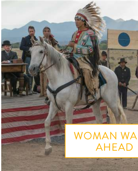
WOMAN WALKS AHEAD